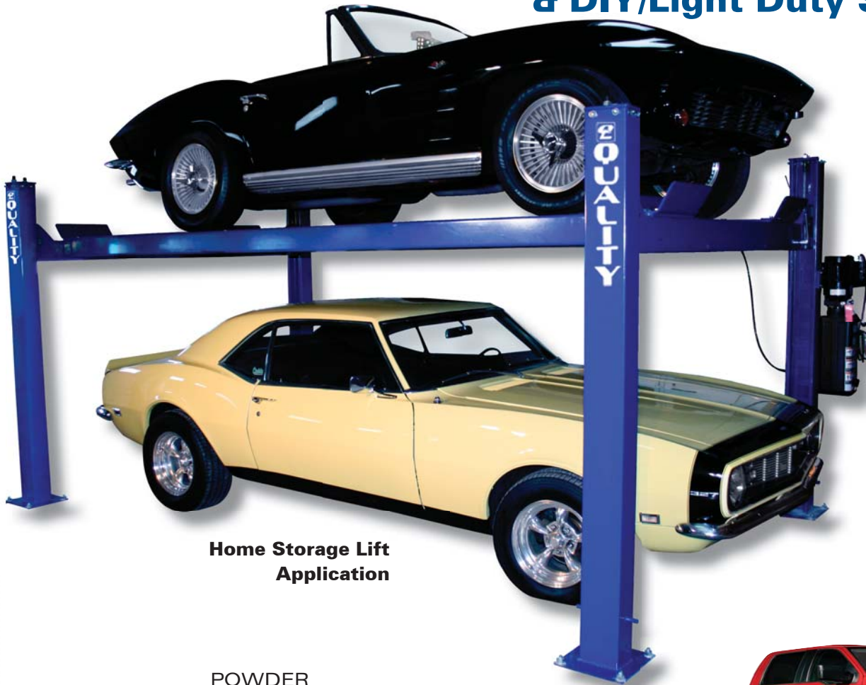
Home Storage Lift Application

Portable or fixed mounted 9,000 lb. capacity 4-Post