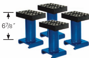
4 high adapters included