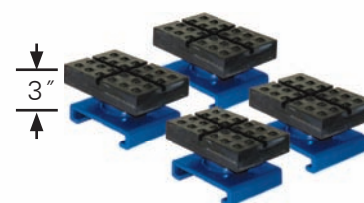
4 low adapters included